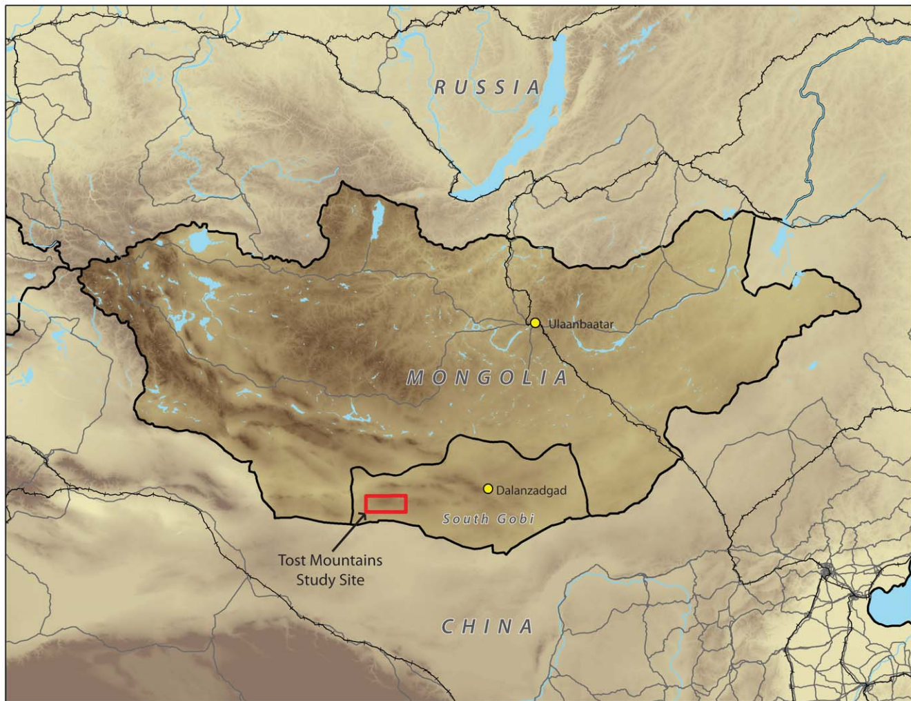
Figure 2. Location of Tost Mountain study site in South Gobi, Mongolia.